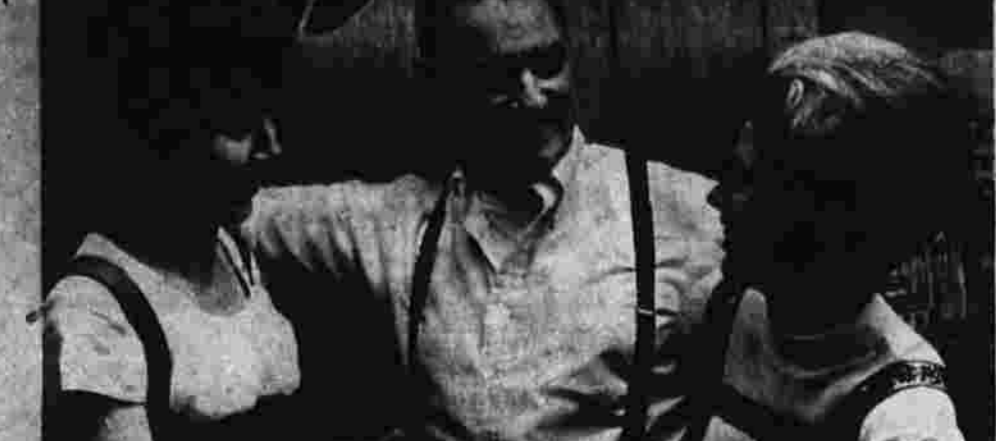
Herr Mayor Awaits Bavarian Fete

(Continued from Page One) should be an opportunity for full participation in the political life of South Vietnam by all political elements. Nixon said, "I don't want anyone to get the impression I'm happy with this budget, but I'll give it my best shot. It's the best they can do."