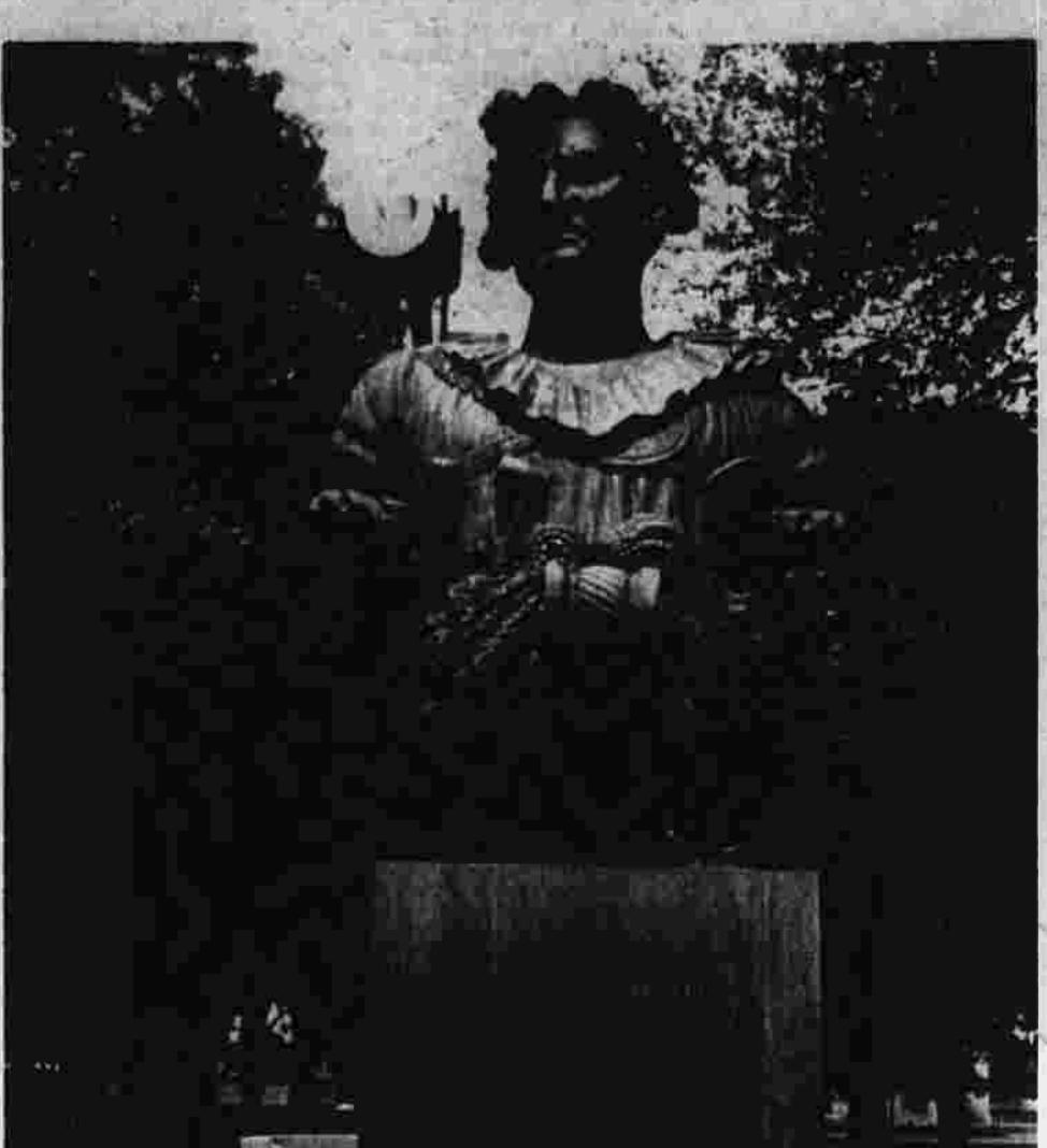
FIGUREHEAD U.S.S. DELAWARE, 1817, ANNAPOLIS, MARYLAND

Melting Pot Once Seemed Easy The forward march of civilization has not been without its setbacks. In the melting pot, the various ethnic groups and racial stocks have not always blended so smoothly as was once thought. In many instances, the various groups have remained distinct, and in some cases, have even become more distinct than when they first came to the United States.